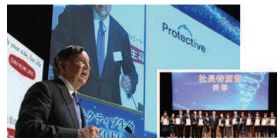
Share and recognize favorable examples of DSR (DSR Convention)