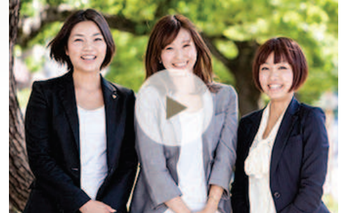
Group Mission, Vision and Values (1min.46sec. (22.241KB))

The Group companies will contribute to comfortable lives with peace of mind and the development of local communities in their respective regions and countries, providing life insurance and related services by sharing the Group's principles (Mission, Vision and Values). We will strive to maximize the value of the Group and aim for sustainable growth by sharing the Group's strategies with each company, moving forward together in the same direction.