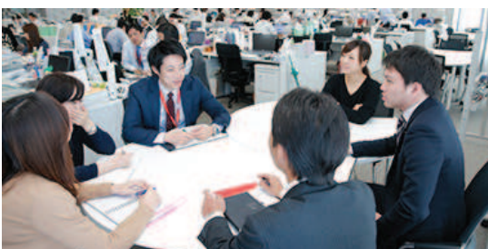
Each employee supports DSR management